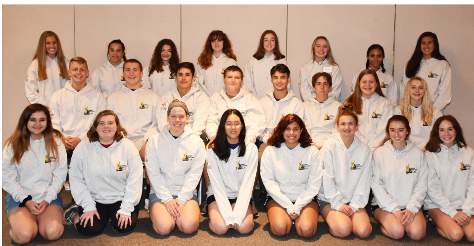
LEADERSHIP BLAIR COUNTY YOUTH CLASS OF 2020

For more information on Leadership Blair County Youth, contact the Chamber at 943-8151.