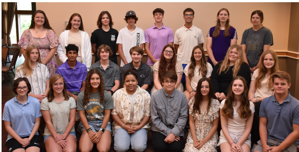
LEADERSHIP BLAIR COUNTY YOUTH - CLASS OF 2024