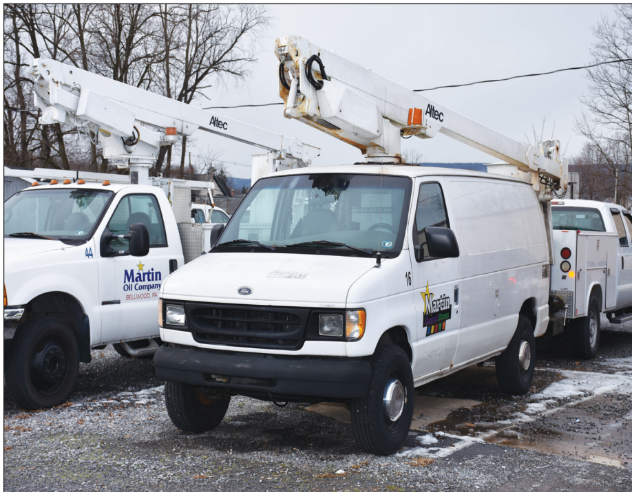
Martin Oil Company often gets credit for just its outstanding convenience stores. But the service component of the company is equally impressive.