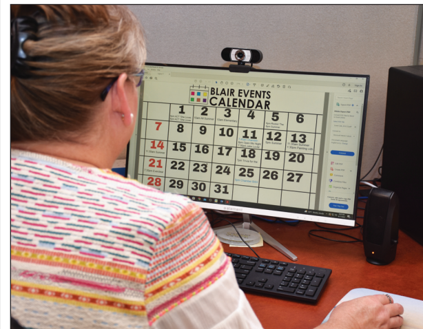
The Blair Events Calendar is a great community tool to find information about upcoming events in Blair County.