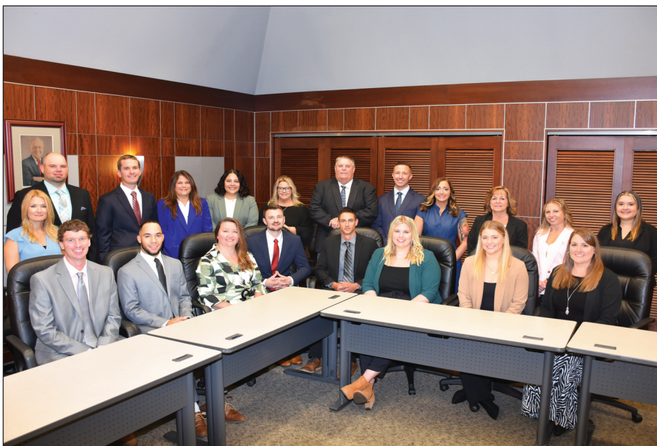
The 2023 Class of the Chamber's Leadership Blair County program is comprised of twenty aspiring servant leaders.

Traditionally, the reason that most LBC class members indicate their interest in applying for the program