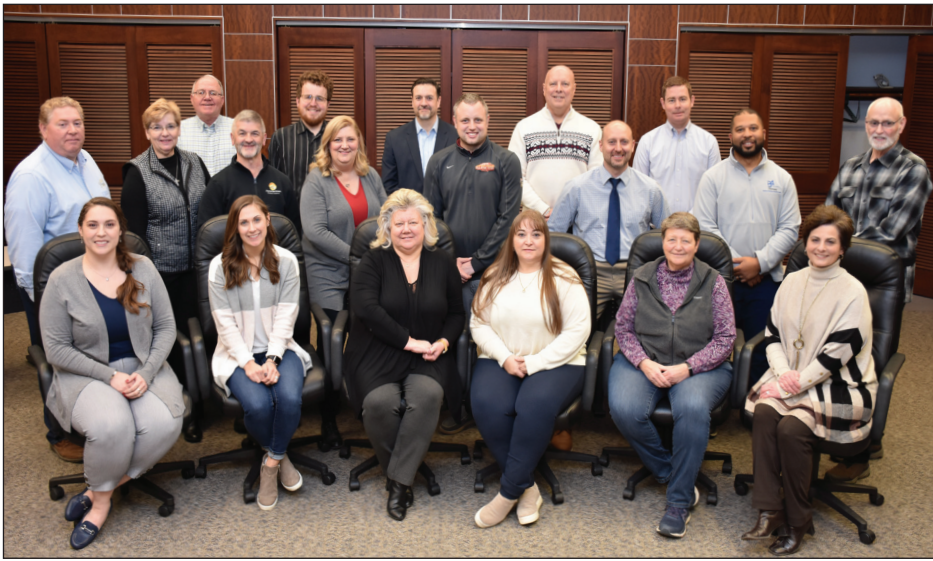
Committee Chairs have played an integral role in the success of the Blair County Chamber. They have also been a good feeder group for the Chamber Board.

The connection between board members and committee chairs is practically seamless. A high percentage of board members chaired committees prior to being elected to the board. In fact, four current board members – Superman