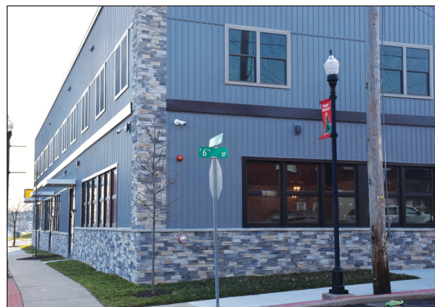
The new building that houses Mama Randazzo's Catering will host the next WE-LEaD networking event.

The Blair County Chamber's WE-LEaD Committee will hold its first event of 2024 – a networking opportunity from 5:00 to 7:00 p.m. on January 31st at Dazzling Realty, LLC, located at 521 North 4th Avenue in Altoona. That building is the new home to Mama Randazzo's Catering and Behe Brothers Brewing.