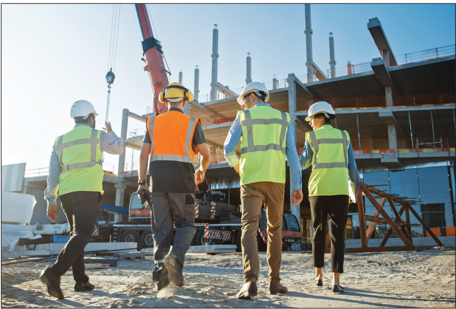
Although limited industrial land presents challenges when building a robust infrastructure, taking a creative approach to repurposing existing sites offers a feasible solution.

Earlier this year, Governor Shapiro and legislators announced a new $500 million fund to help communities like ours to do just that. ABCD Corporation, in partnership with the Chamber, is in the planning phases of identifying and qualifying a primary industrial reuse opportunity that could support new business expansions. We intend to apply for funding through